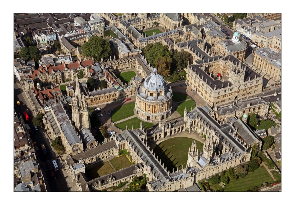
Aerial view of Oxford, with the three main buildings (left to right): St. Mary's University Church (with steeple), the Radcliffe Camera (round building), and the Bodleian Library Old Quad (rectangular building with tower).