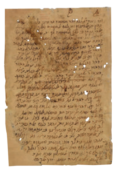
Fig. 3. Maimonides, draft of the Guide for the Perplexed. T-S 10.Ka.4.1, fols. 1r, 1v, 2r, 2v.