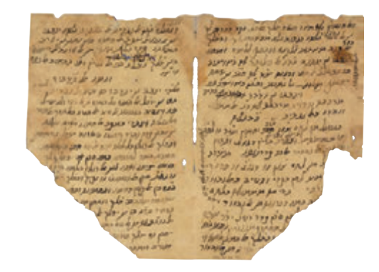
Fig. 5. Maimonides, treatise on sexual intercourse. T-S Ar.44.79, fols. 1r, 1v. Used by kind permission of the Syndics of Cambridge University.