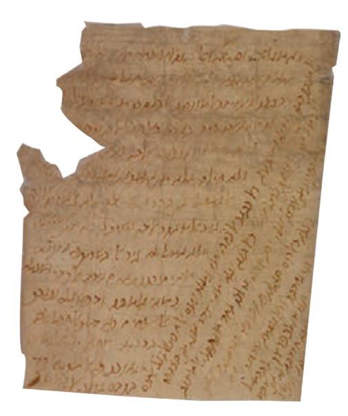
Fig. 2. Judah ha-Levi. ENA I.5 (L41).

And one who raises up a life within Israel, he brings upon himself the saying, 'It is as if he raised up an entire world."" When one looks at the manuscripts, however, one realizes that the phrase מישראל ("within Israel") is lacking. These documents testify to the real world view of the rabbis: every single human life-Jewish or non-Jewish-is to be valued.