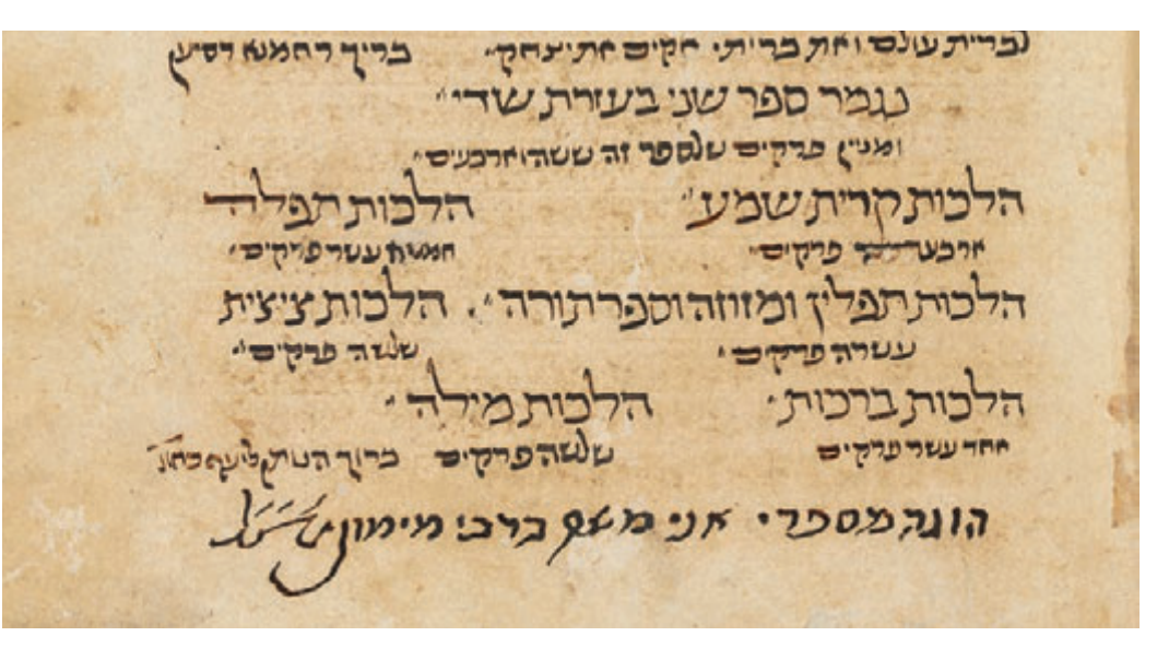
Fig. 7. Maimonides Mishneh Torah signature. MS Huntington 80, fol. 165r.

My proposal is that centuries of medieval antisemitism, especially within Christian Europe, led the Jewish community to have a less sanguine attitude toward the value of the lives of non-Jews. Blood libels, accusations of host desecrations, rampant killings, inquisitions, expulsions, and more had taken their toll. The Jewish community turned inward, away from the universalist outlook expressed by the classical rabbis. The great ecumenical ideal enunciated in the Mishnah was transformed into a parochial statement by later Jews: what a teachable moment.