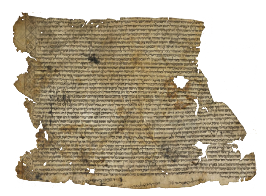
Fig 8. Karaite-Rabbanite ketubba. Bodleian MS Heb a.3.42.