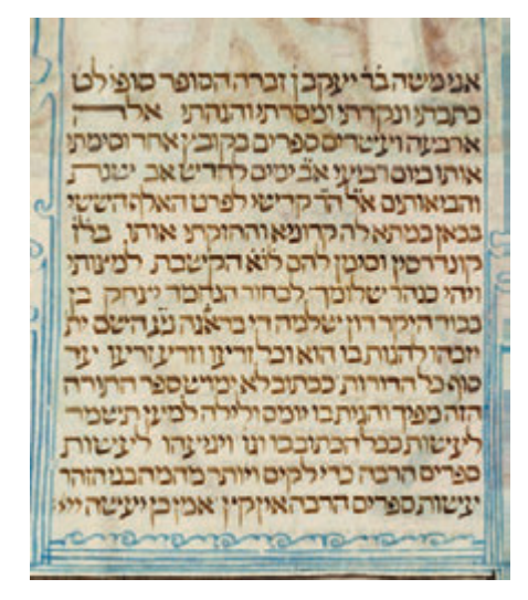
Fig. 11. Kennicott Bible colophon. MS Kenn 1, fol. 438r.

students are ready for "Jewish History II: Early Modern and Modern."